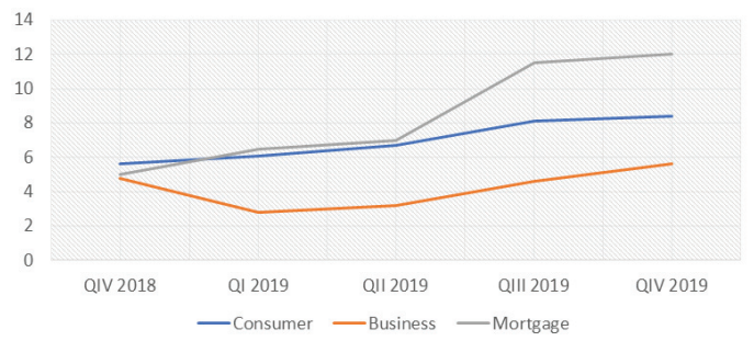
Figure 2: Credit Growth (% Change)

As the commercial banks' average prime lending rate remained unchanged at 9.26 percent, the demand for credit encouragingly grew at healthy rates during the last three months of 2019. For instance, commercial banks' loans to businesses expanded by 2.9 percent over the levels recorded in the third quarter and 5.6 percent y-o-y, while consumer credit grew by 3.5 percent compared to the previous quarter and 8.4 percent y-o-y. Similarly, mortgage loans increased by 12 percent on a y-o-y basis and 2.6 percent in comparison to the previous quarter (Figure 2).