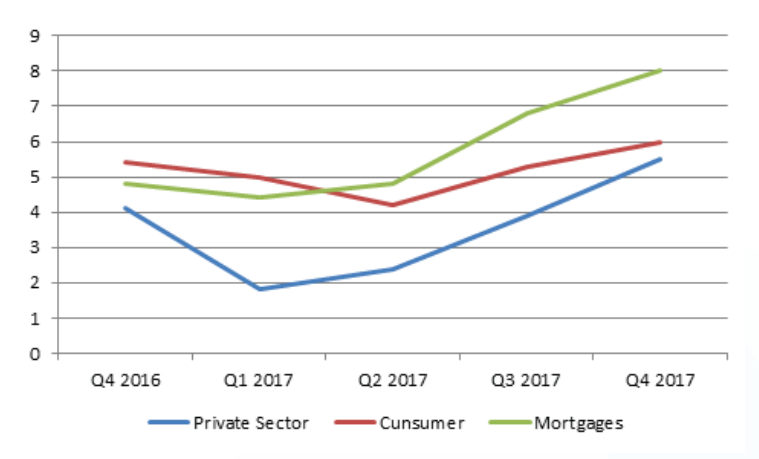
Figure 2: Credit Growth (% Chg.)