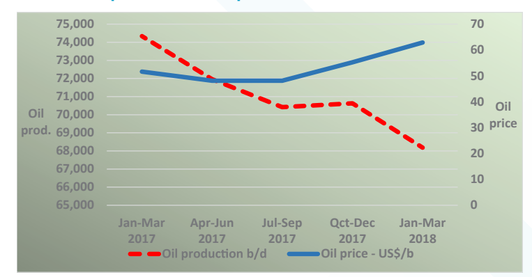
Chart 1: Oil production and price