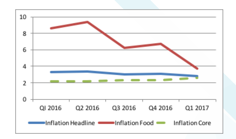
Figure 1: Inflation (%)

With the Repo rate unchanged, the commercial banks' average prime lending rate remained at 9.08 percent in March 2017, while the mortgage market reference rate (MMRR) stayed at 3 percent. However, the demand for credit continued to slow during the first quarter of 2017, as loans by the consolidated financial sector to businesses declined by 0.7 percent y-o-y in March. Reflective of weak credit demand, financial system liquidity remained fairly high during the first quarter of 2017. Commercial banks' excess reserves, which averaged $3.5 billion in the fourth quarter of 2016, rose above $4 billion in late March, before averaging $3.4 billion in April.