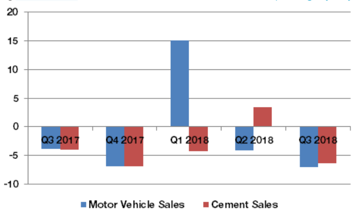
Figure 2: Cement Sale & New Motor Vehicle Sales (% Chge. y-o-y)

The ongoing woes of the construction industry are perhaps the best example of how difficult it is to boost and sustain economic activity in the non-energy sector at the moment. After a 20 percent increase in cement sales during the second quarter of 2018 compared to the first, cement sales fell by 20.1 percent between July and September, suggesting an erosion of the brief momentum gained in construction activity. This is likely related to delays in government projects. On a year-on-year (y-o-y) basis cement sales fell by 7 percent during the third quarter (Figure 2). Judging by new motor vehicle sales, activity in the trade and repair sector remained anaemic during the period. In the third quarter, new motor vehicle sales increased marginally by 0.6 percent compared to the second quarter of 2018, but was 7 percent below the figure recorded during the same period in 2017. In general, the progress of the non-energy sector continues to be curtailed by fragile demand.